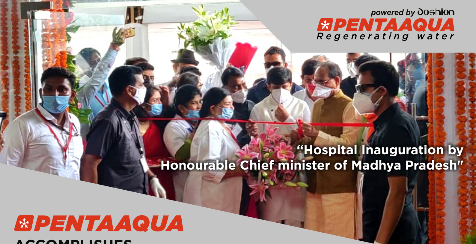
“Hospital Inauguration by Honourable Chief minister of Madhya Pradesh”