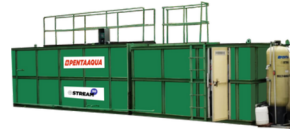
STREAM MBBR PACK Space Saving Sewage Solutions