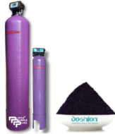
PENTA PURPLE PURE