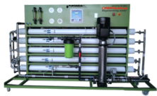
PUROAQUA RO PACK Compact & Cost Effective RO Solution