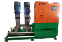
CLOUDBURST TURBO PACK Automated Solar/ Non-Solar Booster Pumps