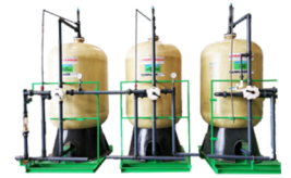
RAINMAKER CONDITIONING PACK Manual & Automated Water Conditioners